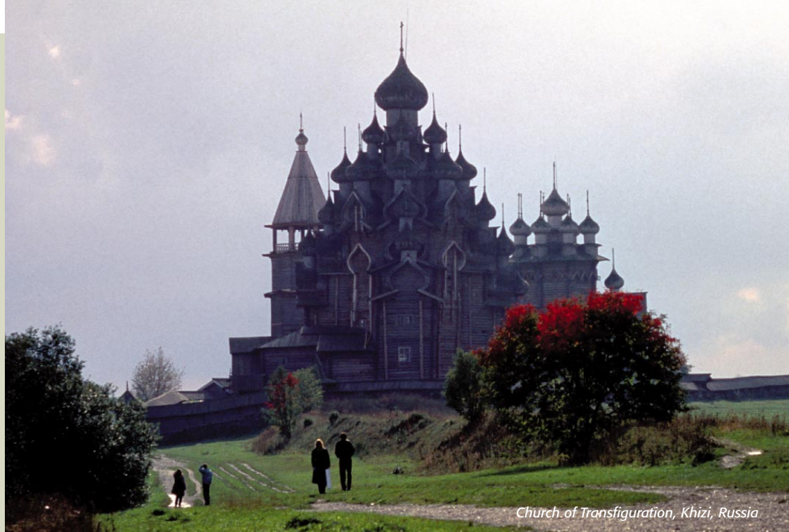
Church of Transfiguration, Khizi, Russia