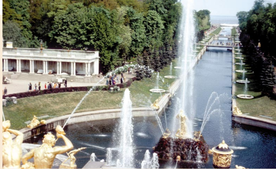
Petegof Grand Cascade Fountain, St. Petersburg