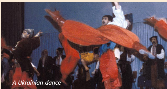
A Ukrainian dance