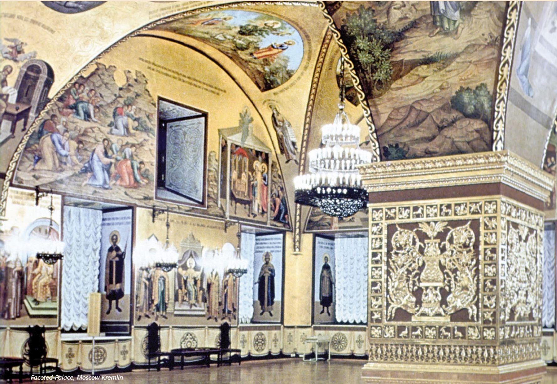
Faceted Palace, Moscow Kremlin