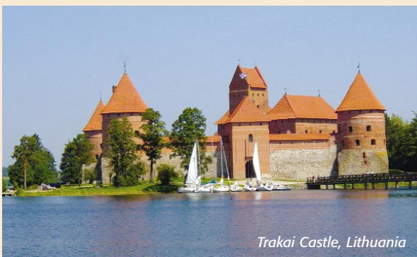
Trakai Castle, Lithuania