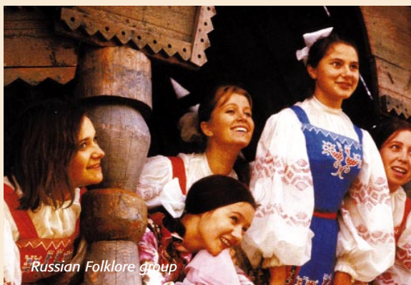
Russian Folklore group