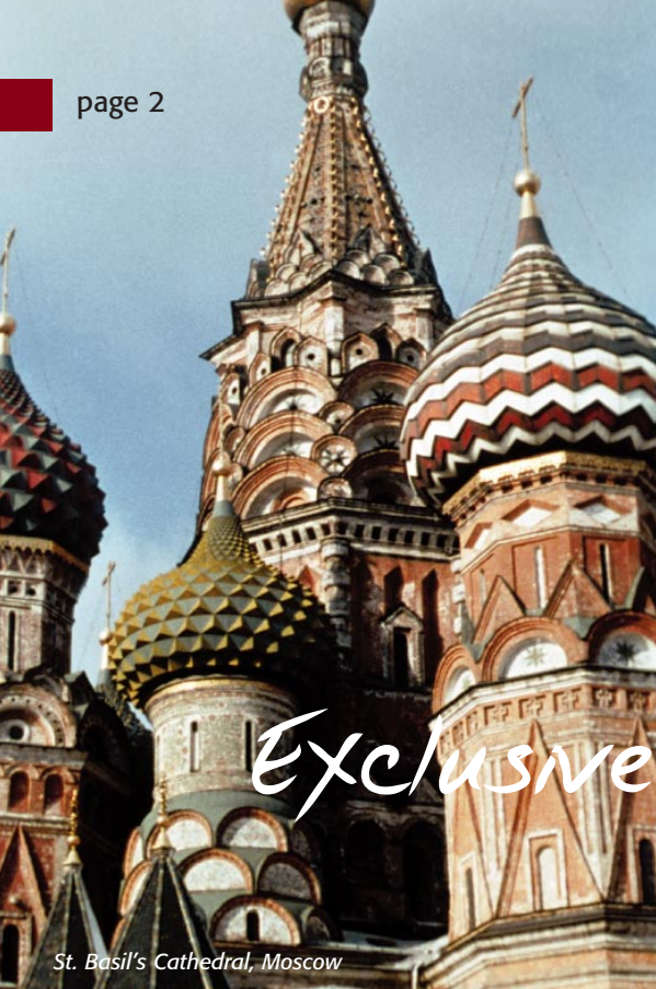
St. Basil's Cathedral, Moscow