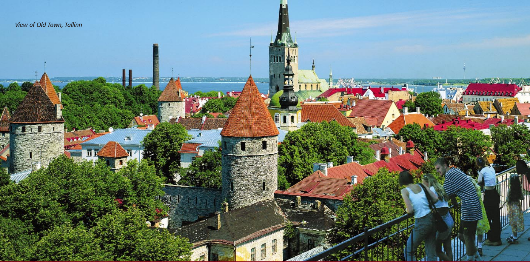
View of Old Town, Tallinn

Call Frontiers to receive a brochure, and let us plan your very special vacation – a trip far and beyond your expectations.