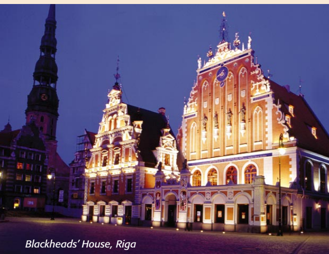
Blackheads' House, Riga