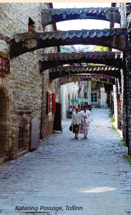
Kataring Passage, Tallinn

Call Frontiers to receive a brochure, and let us plan your very special vacation – a trip far and beyond your expectations.