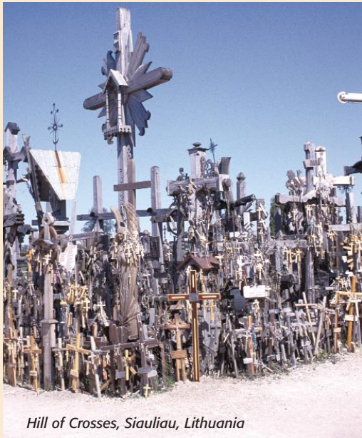
Hill of Crosses, Siauliai, Lithuania

Our bilingual certified staff will efficiently interact on your behalf to ensure a smooth and enjoyable trip. We offer you reliable on-site support in each country.