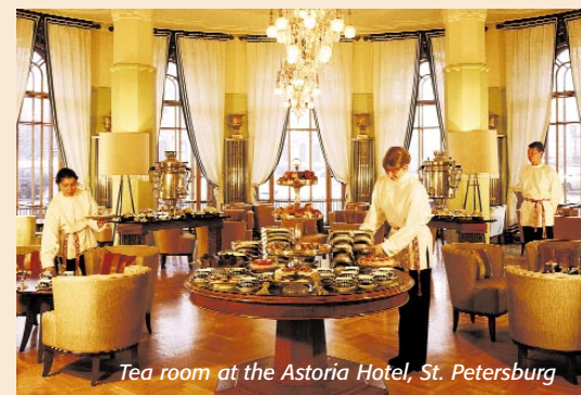
Tea room at the Astoria Hotel, St. Petersburg

As members of Virtuoso , the most prestigious and established travel network in the world, we can assure you that you will be getting more simply by booking through us.